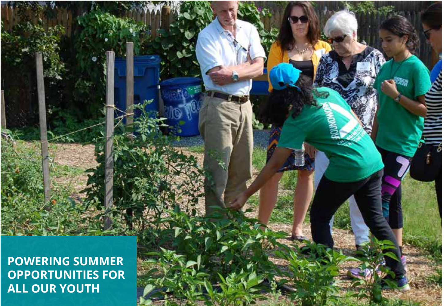
Teens at Groundwork Lawrence.

a fund of Essex County Community Foundation