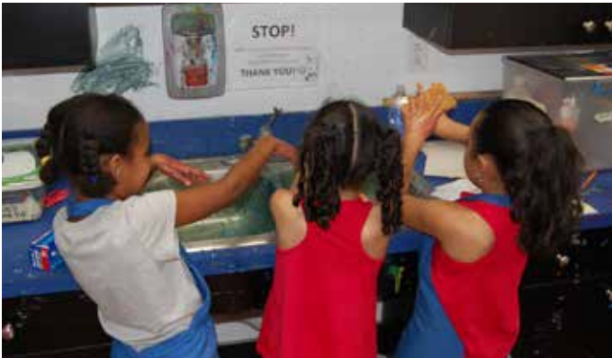
Youth finishing artistic masterpiece at Essex Art Center.