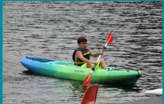
A river day at Greater Lawrence Community Boating.

There is a very real difference between the educational and economic opportunities available to youth in Lawrence versus the majority of their peers living in Essex County. Many do not have access to resources like Internet or transportation to seek out opportunities beyond the city, leaving them with little to no control over their personal growth.