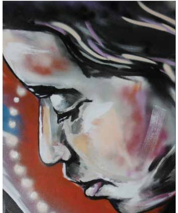
Art created with nonprofit, Elevated Thought.