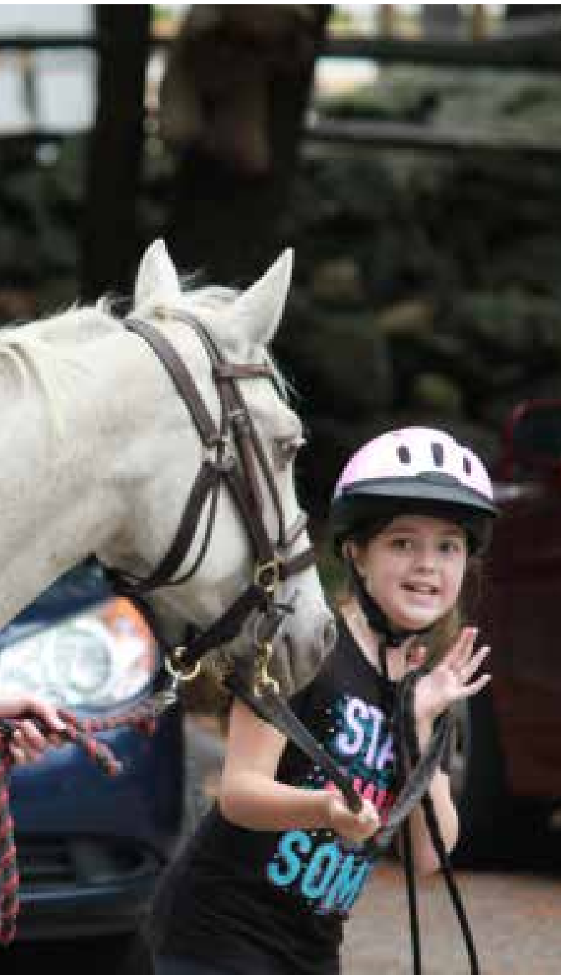
First-time riders at Windrush Farm.