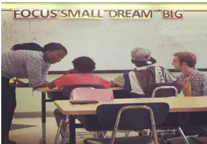
Teens gain skills at Teach For America.

Lack of educational experiences over the summer months contribute significantly to learning loss and the growing achievement gap between low-income children and their more affluent peers. Coming mostly from low-income families, youth in Lawrence are already behind academically and cannot afford to lose any more ground while out of school for the summer season.