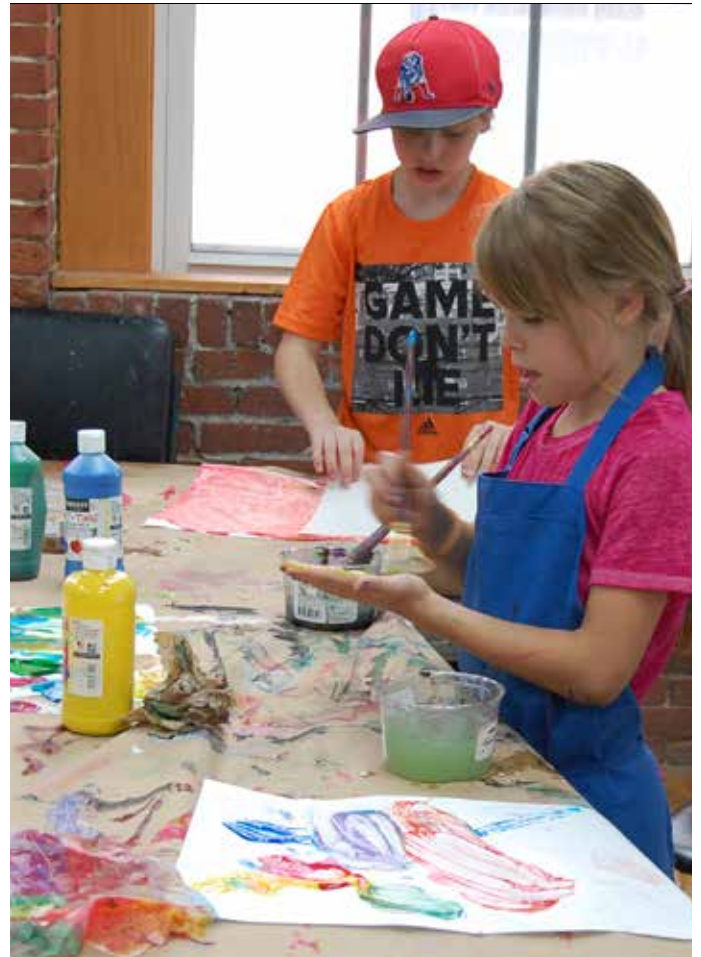
Youth expressing themselves at Essex Art Center.

*indicates more than one donor gave anonymously