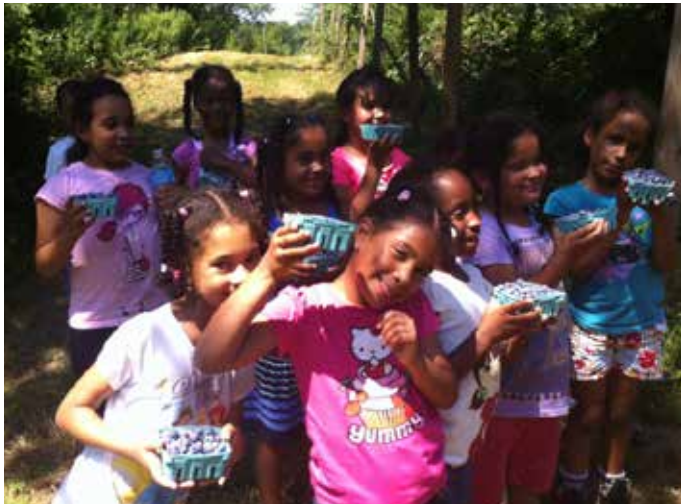
Blueberry picking with Lawrence YMCA.