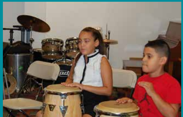
Bongo players at Lawrence Boys & Girls Club.