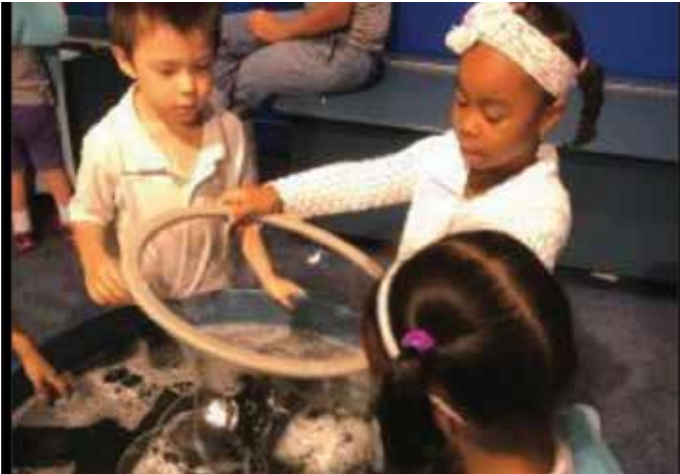
Hands-on learning at Lawrence Family Development.