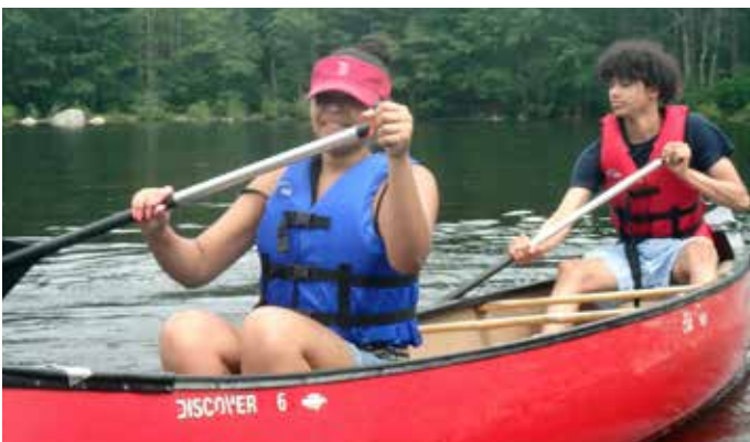
Teens exploring with Appalachian Mountain Club.