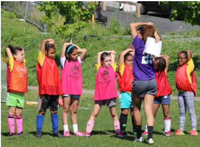
Soccer enthusiasts warming up at Beyond Soccer.

Lawrence Public Schools lack adequate physical education facilities to accommodate the ever-growing student population and there are limited private sports organizations in the city for healthy living programs. Our children suffer the consequences with higher rates of childhood obesity and diabetes.